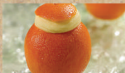
Orange Ripieno 8.70 Orange sorbetto served in the natural fruit shell