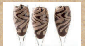
Hazelnut Chocolate Flute 9.80

GS = Contains gluten-sensitive ingredients. We are not a gluten-sensitive environment. Please let us know of any food allergy or accommodations. Ask for a manager.