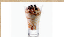
Coppa Caffè in a Glass 9.80 Fior di latte gelato with rich coffee and pure cocoa swirl