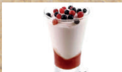
Coppa Yogurt & Berries 9.80