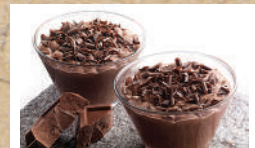
Chocolate Mousse 9.80 Rich chocolate mousse and zabaione, topped with chocolate curls