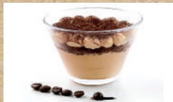
Tiramisu in a Glass 9.80 Sponge cake soaked in espresso, topped with mascarpone cream and dusted with cocoa powder