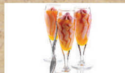
Guava Mango Flute 9.80 Creamy tropical guava gelato swirled with sweet mango sauce