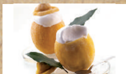
Lemon Ripieno 8.70 Refreshing lemon sorbetto served in the natural fruit shell