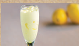
Limoncello Flute 9.80