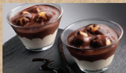
Profiteroles in a Glass 9.80 Cream puffs surrounded by vanilla and chocolate cream