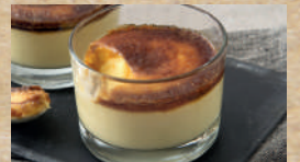
Crème Brûlée in a Glass 9.80 Creamy custard topped with caramelized sugar