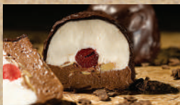
Bomba 9.80 Classic vanilla and chocolate gelato separated by a cherry and sliced almonds covered in cinnamon, finished with a chocolate coating