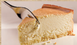
Cheesecake 8.70 Traditional New York cheesecake flavored with a hint of vanilla, on a sponge cake base