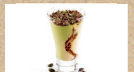
Coppa Pistachio 9.80 Custard gelato swirled together with chocolate and pistachio gelato, topped with praline pistachios