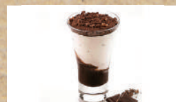
Coppa Stracciatella 9.80 Chocolate chip gelato swirled together with chocolate syrup, topped with cocoa powder and hazelnuts