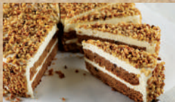
Carrot Cake 8.70 Alternating layers of carrot cake spiced with cinnamon, chopped walnuts and pineapple, covered with a smooth cream cheese topping and sprinkled with crushed walnuts