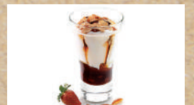
Coppa Strawberries & Caramel 9.80 Fior di latte gelato swirled with caramel, almond crunch and wild strawberries, topped with slivered almonds